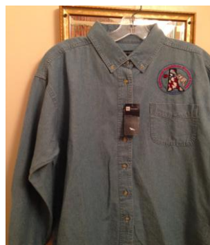
1 Long Sleeve Light Denim Shirt with PRWC Logo