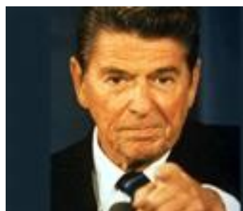
Ronald Reagan, 1983

I strongly support an amendment that will permit our children to hold prayer in our schools.