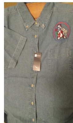
2 Short Sleeve Light Denim Shirts with PRWC Logo.

Do You Need a PRWC Denim Shirt? We Have Some Large PRWC Shirts Available for the reduced price of $15.