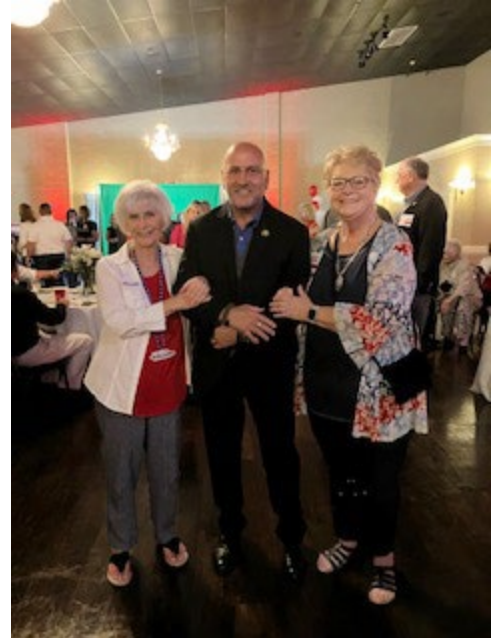
Folding the Flag to celebrate Flag Day